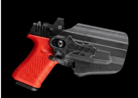
Show with a GLOCK 19 Holster

TITAN-X also fits into most standard holsters, making it the ultimate tool for holster draw analysis.