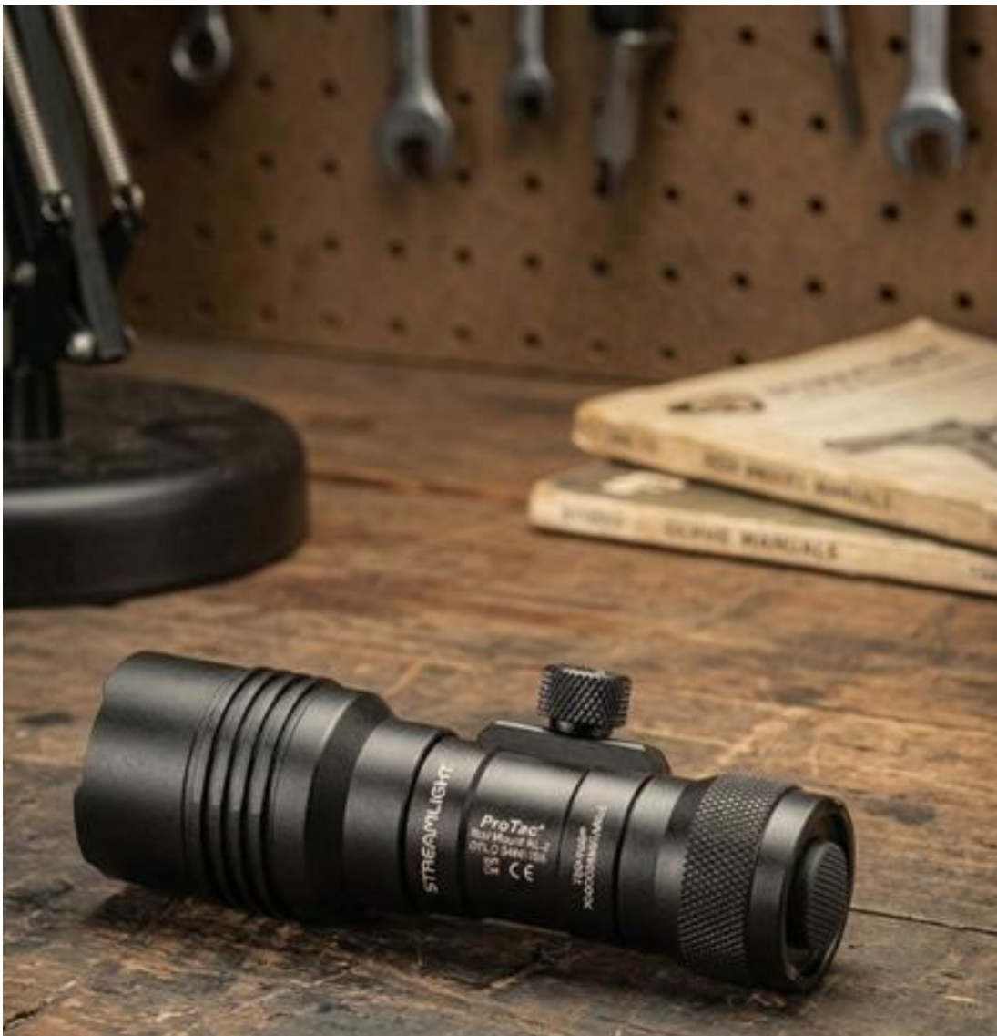
STREAMLIGHT'S PROTAC RAIL MOUNT 1L-X PRO USB

Copyright © 2026 by Twobirds Flying Publications