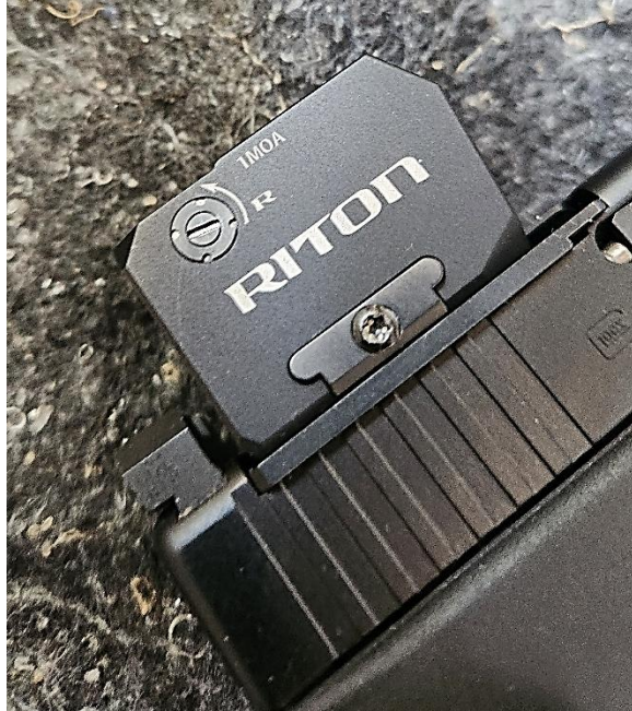
RITON OPTICS 3 Tactix EED

There's little doubt that red dot sights on pistols are here to stay, and over the past few years the industry has seen pistol manufacturers produce milled slides to accommodate a red dot sight along with its appropriate mounting plate.