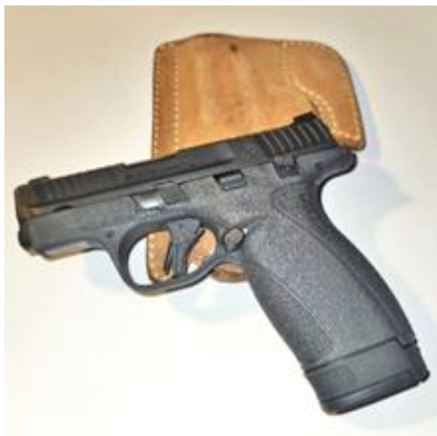
External safety model shown with safety engaged

As previously noted, the Bodyguard 2.0 is a compact pocket pistol; therefore, shooters with larger hands, or longer fingers, should be mindful of their support hand placement. Smith & Wesson addresses this concern with an ambidextrous, textured thumb rest.